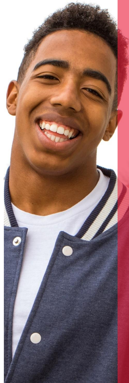
Graduation rate increase 4.9% in 4 years

College reports from former students also say they are excelling among their peers in independent learning, research and overall technology literacy skills because of their experience in the Bauxite Academy.